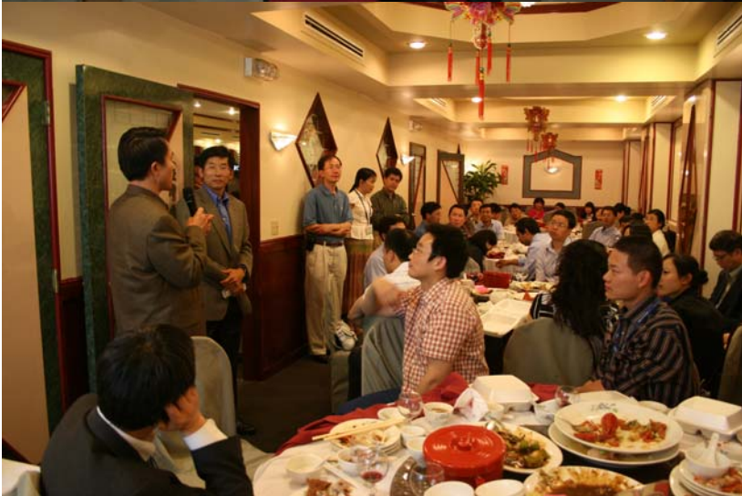
Some happy gathering pictures!